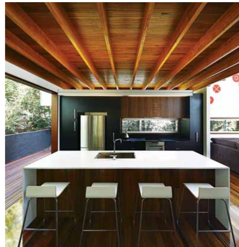
these pages: Materials include a lot of timber, locally crafted and evocative of nature and durable warmth.

initially a concern given that this extension is built in a pre-war character area. Yet subsequently the project was given overwhelming support for its progressive but equally sensitive approach, in sympathetically avoiding any demolition of the older fabric.