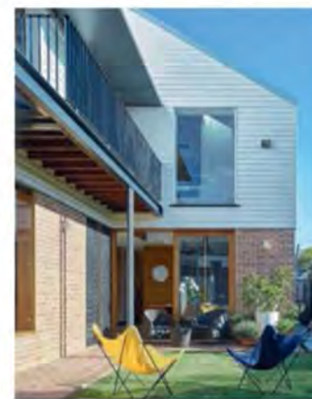
HEARTH AND HOME ... A fireplace makes the outdoor living area useable year-round.