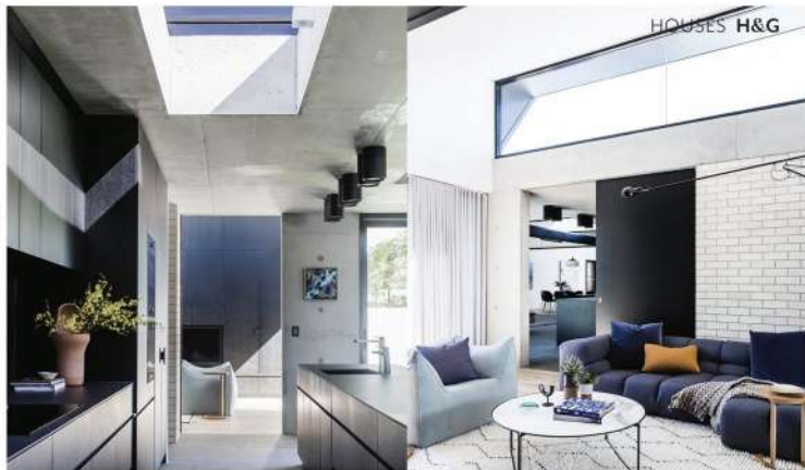
FAMILY ROOM above right A sliding door between this room and the kitchen enables the children's wing to be closed off. Vintage "Le Bambole" chair, Istids. Sofa, Space. Coffee table, Cule. Wall light, Euraluce. Rug, Armadillo & Co. Linen curtains, Warwick Fabrics. MAIN ENSUITE The aged-brass finish on the Astra Walker tapware references the original cottage. Zuster 'Zi' mirrors, Reeco. Porcelain benchtop in Calacatta Paragon, Arredomas. Bluestone wall-tiles, Eco Outdoor. Stool, Living Edge. Smart buy: Buster+Punch "Heavy Metal" solid steel pendant lights, $265 each, Living Edge.